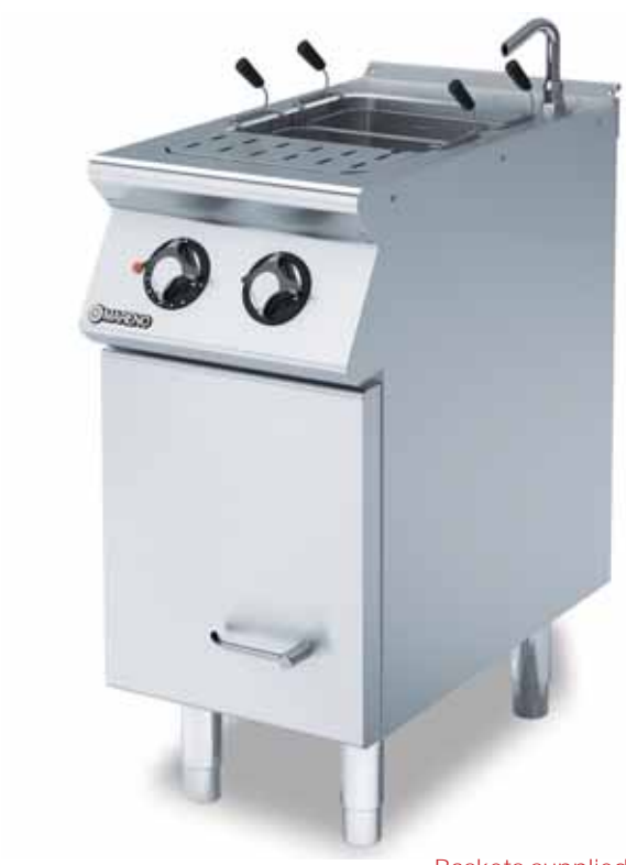
Baskets supplied separately