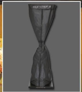
Optional heater cover available (TGHCOVER)

The new HEATSTRIP portable LPG heater incorporates world leading design, quality, heat performance and efficiency to provide a stylish, robust and elegant solution for your outdoor area, alfresco, balcony, patio etc.