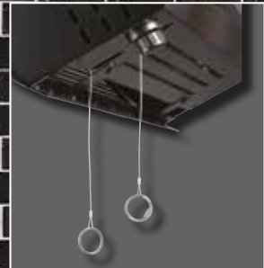
ON / OFF switch with electronic ignition