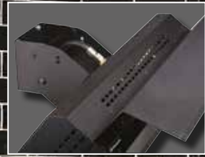
Wall mounting bracket